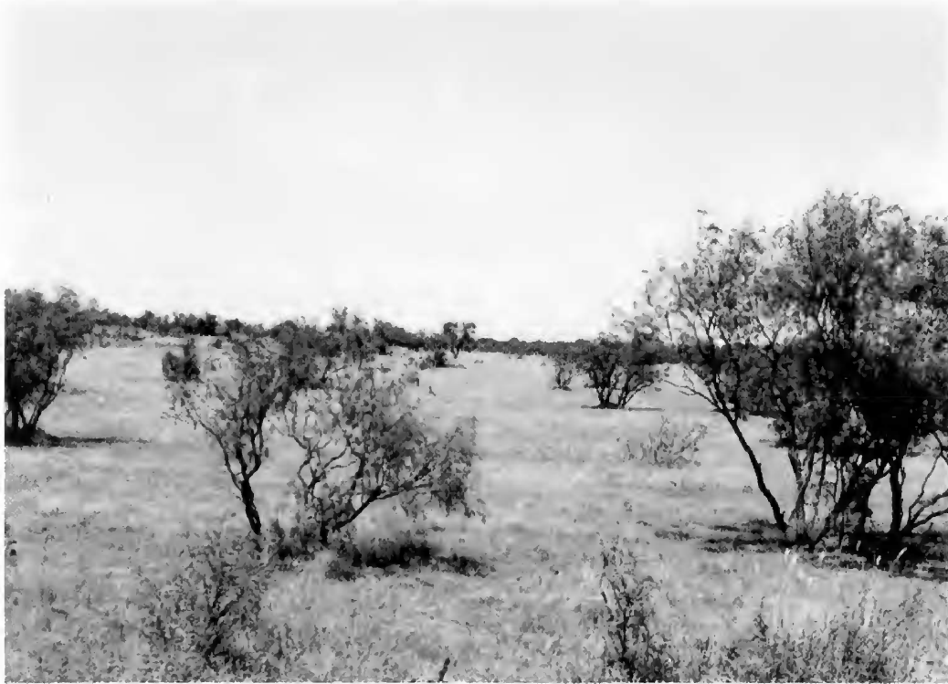
Figure 4. Mesquite grassland habitat at Lake Meredith National Recreation Area.

Additional records. — Potter Co.: Unspecified locality (Schmidly, 1991:100; Davis and Schmidly, 1994:49).